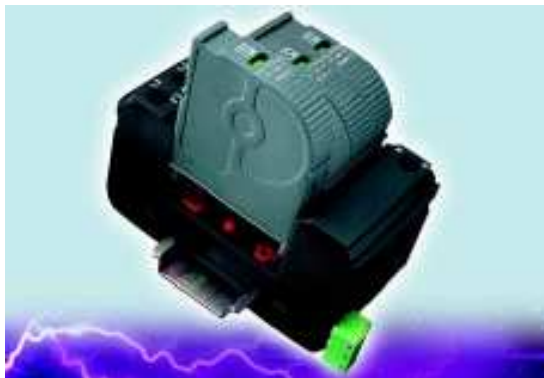
Surge diverter module

The solution can be used for all our model ranges and, while meeting highest expectations as regards performance and convenience, doesn't require a major effort.